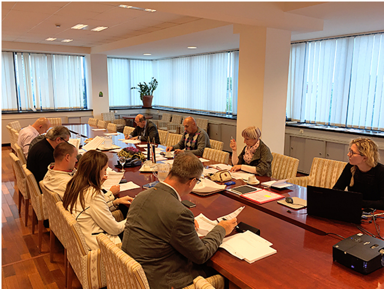
Inaugural session of Sectoral Council XXIV. Security and Defence