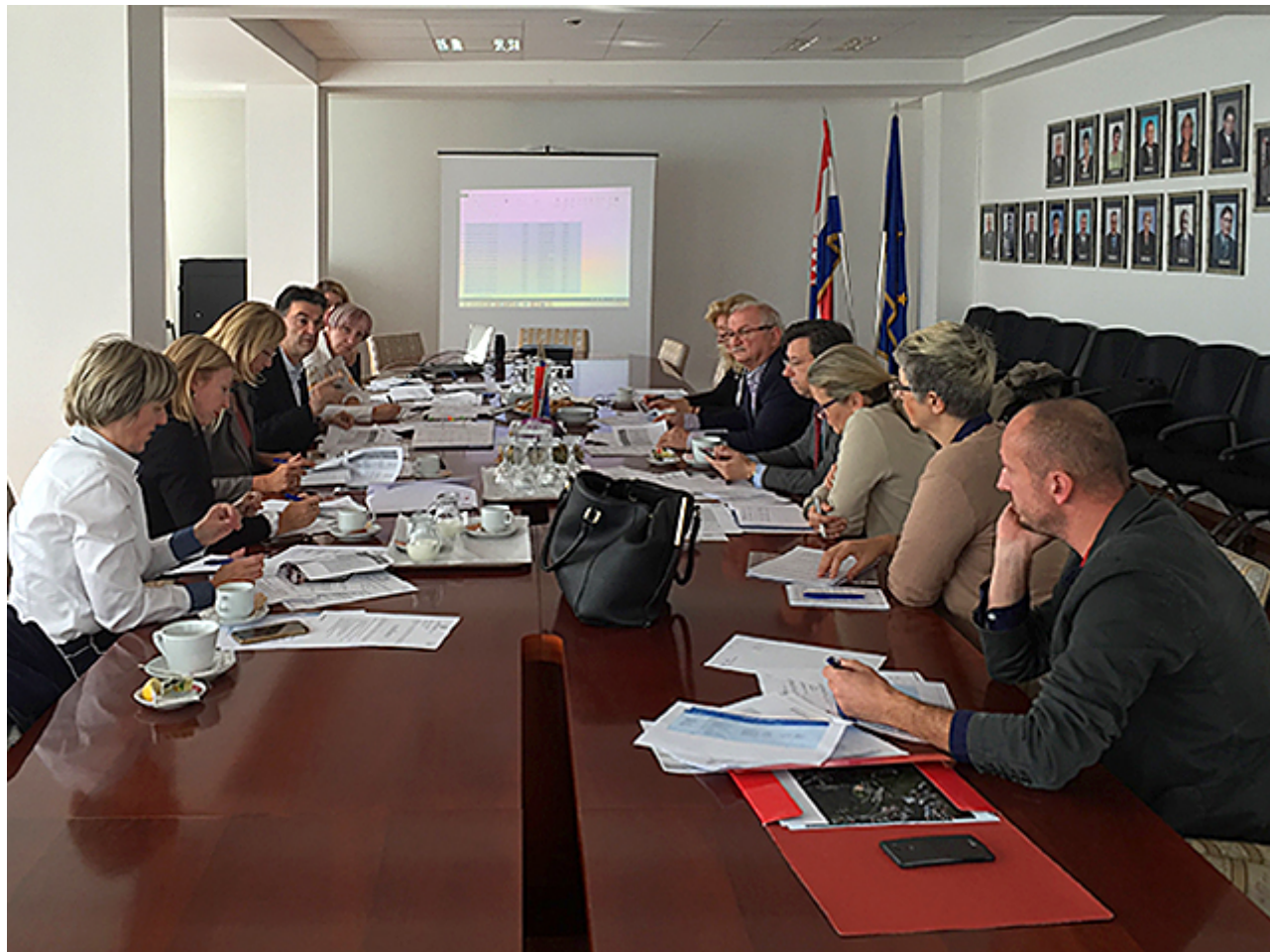
Inaugural session of Sectoral Council VIII. Construction and Geodesy