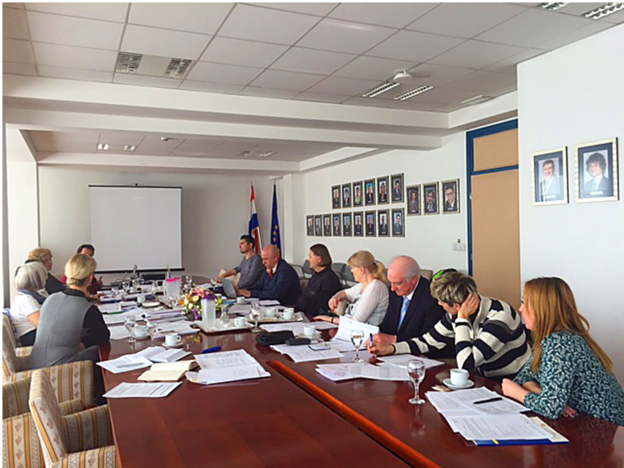
Sectoral Council IX – Economy and Trade was presented with a proposal for the occupational standard for the Forensic Accountant , as prepared by Split University's Forensic Sciences Department;