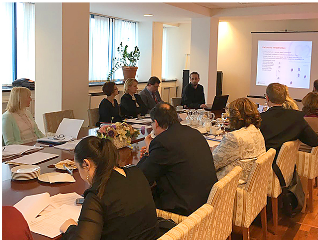
19 th NCDHP session

On 2 February 2017, the Ministry of Science and Education hosted the 19 th NCDHP session , at which the NCDHP members were introduced to the CROQF Register's IT system set up to support the submission and validation processes related to requests for inclusion in the CROQF Register and ensure access to public data kept in the Register. Furthermore, they were presented with a proposal for new quality assessment standards for higher education institutions in the process of re-accreditation, which will, once discussed and adopted, apply in the next re-accreditation cycle. Additionally, the Framework Work Programme of the NCDHP for 2017 and the Sectoral Council Work Report for 2016 were proposed and adopted. Participants were also briefed on the content of the National Qualifications Standard Framework for primary and secondary school teachers, which was adopted as a recommendation by the National Education Council.