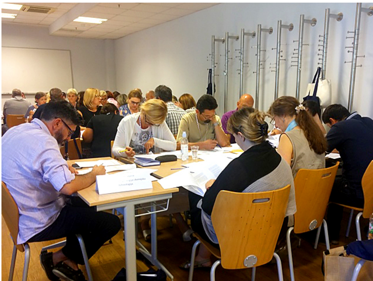
Workshop for sectoral councils within the conference