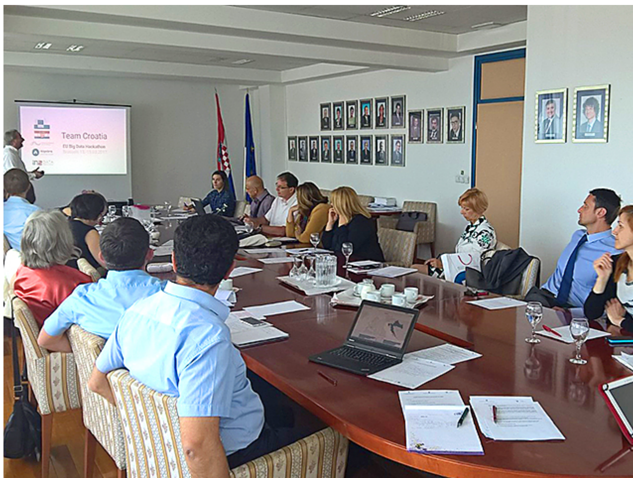
21 st NCDHP session

informal learning, held on that same day, with an additional workshop announced to further discuss the same topic. Also, the session agenda included problems in the vocational education system in the context of the Vocational Education and Training System Development Programme.