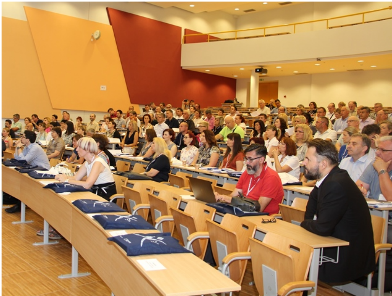
Conference to mark the establishment of 14 sectoral councils