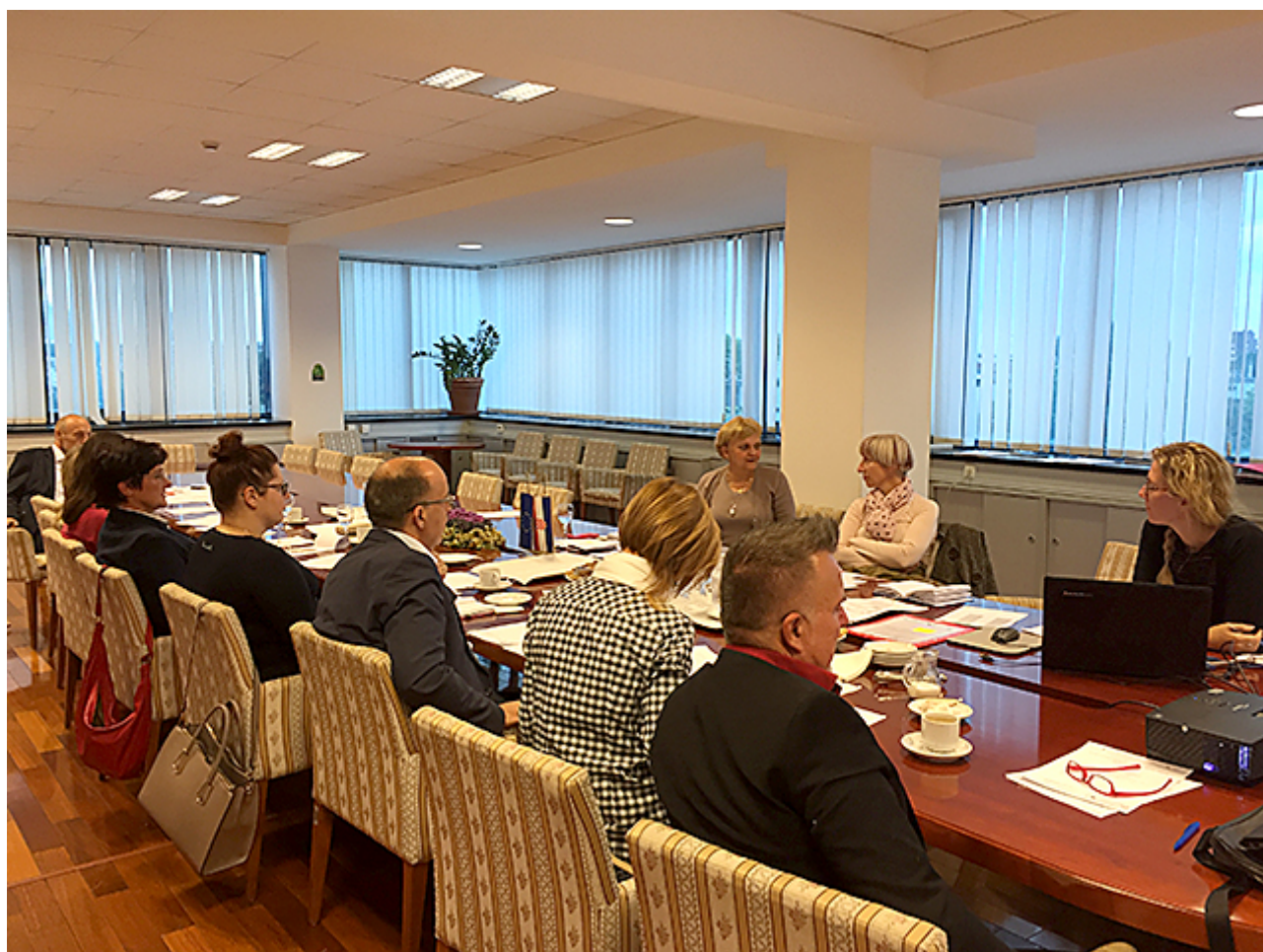
Inaugural session of Sectoral Council XX. Psychology, Educational Rehabilitation, Speech Pathology and Social Work