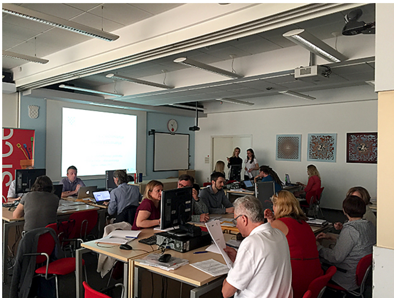
Workshop: simulation of validation of proposals for occupational standards

From the establishment of sectoral councils, the relevant ministries support them in their efforts. Accordingly, they provide them with continuous training to prepare their members for the effective performance of their tasks as stipulated under the CROQF Act. Since the key purpose of sectoral councils is precisely the expert validation of proposals for occupational and qualifications standards, the eight sectoral councils have participated in a number of workshops organised as part of their continuous training in order to gradually prepare them for the validation exercise, with workshops dedicated to the simulated validation of concrete proposals for standards as the final stage of their preparation before engaging in the validation of actual requests for inclusion of standards in the CROQF Register. Since a positive opinion from the relevant sectoral council is a prerequisite for inclusion of any standard in the CROQF Register, sectoral councils will have a direct bearing on the quality of standards included therein. Therefore, their preparation for validation is of utmost importance.