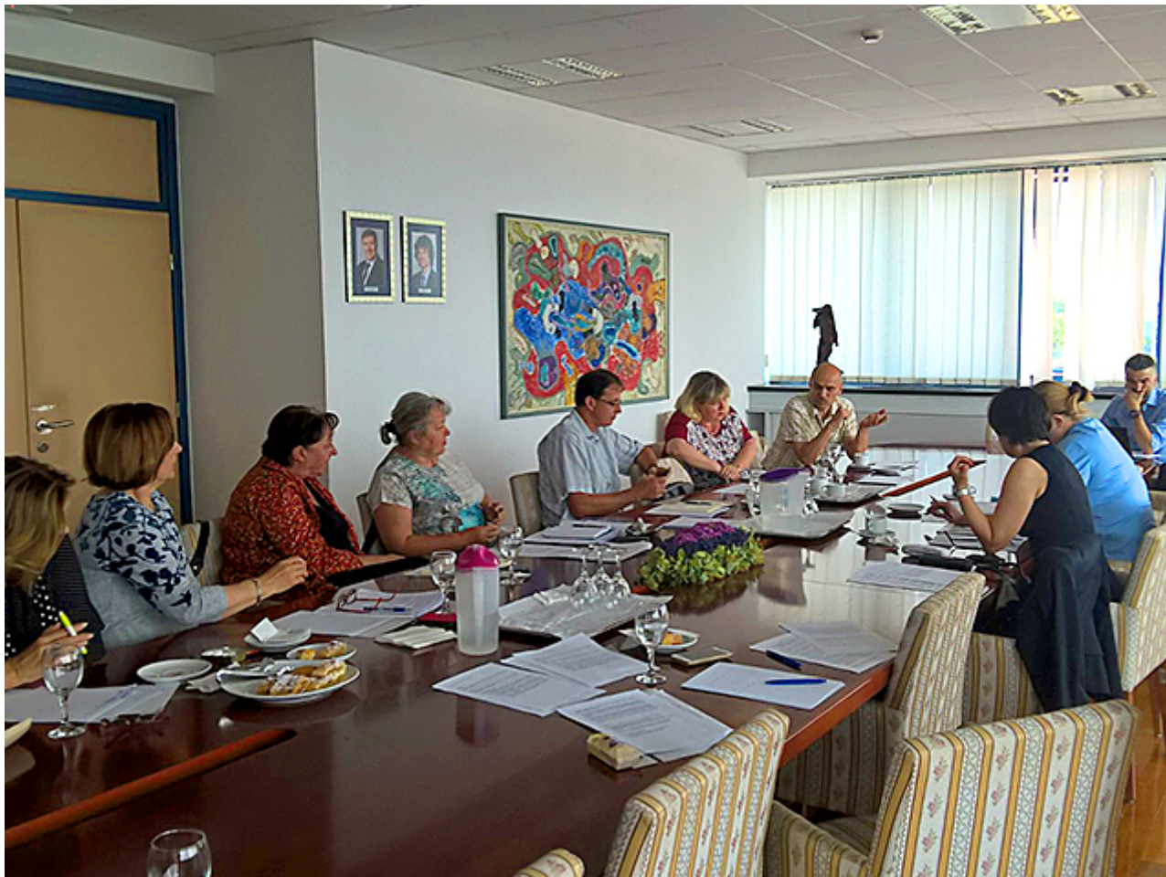
Workshops on “Vision, Mission and Strategic Goals of Validation of Non-formal and Informal Learning”