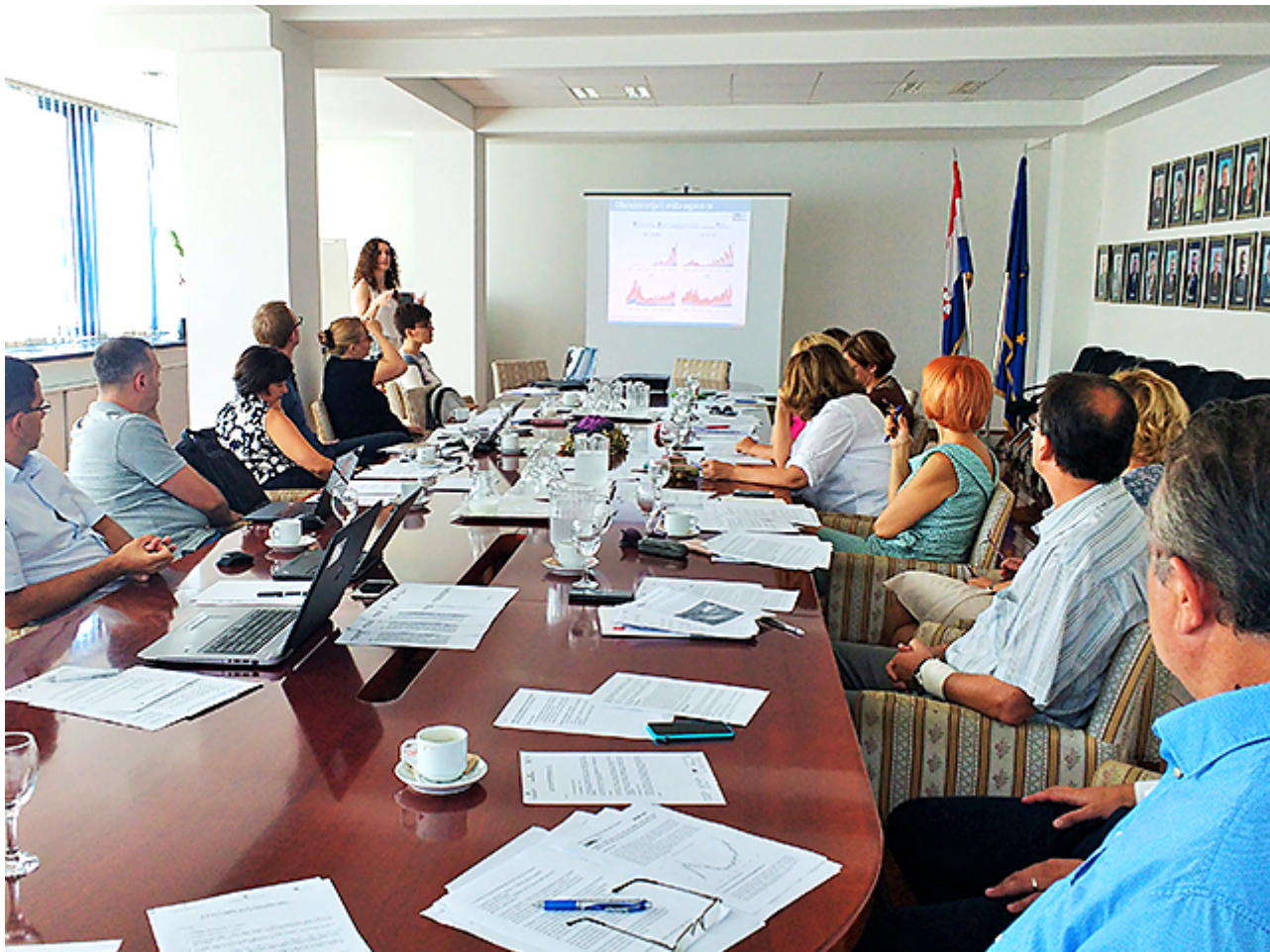
22 nd NCDHP session