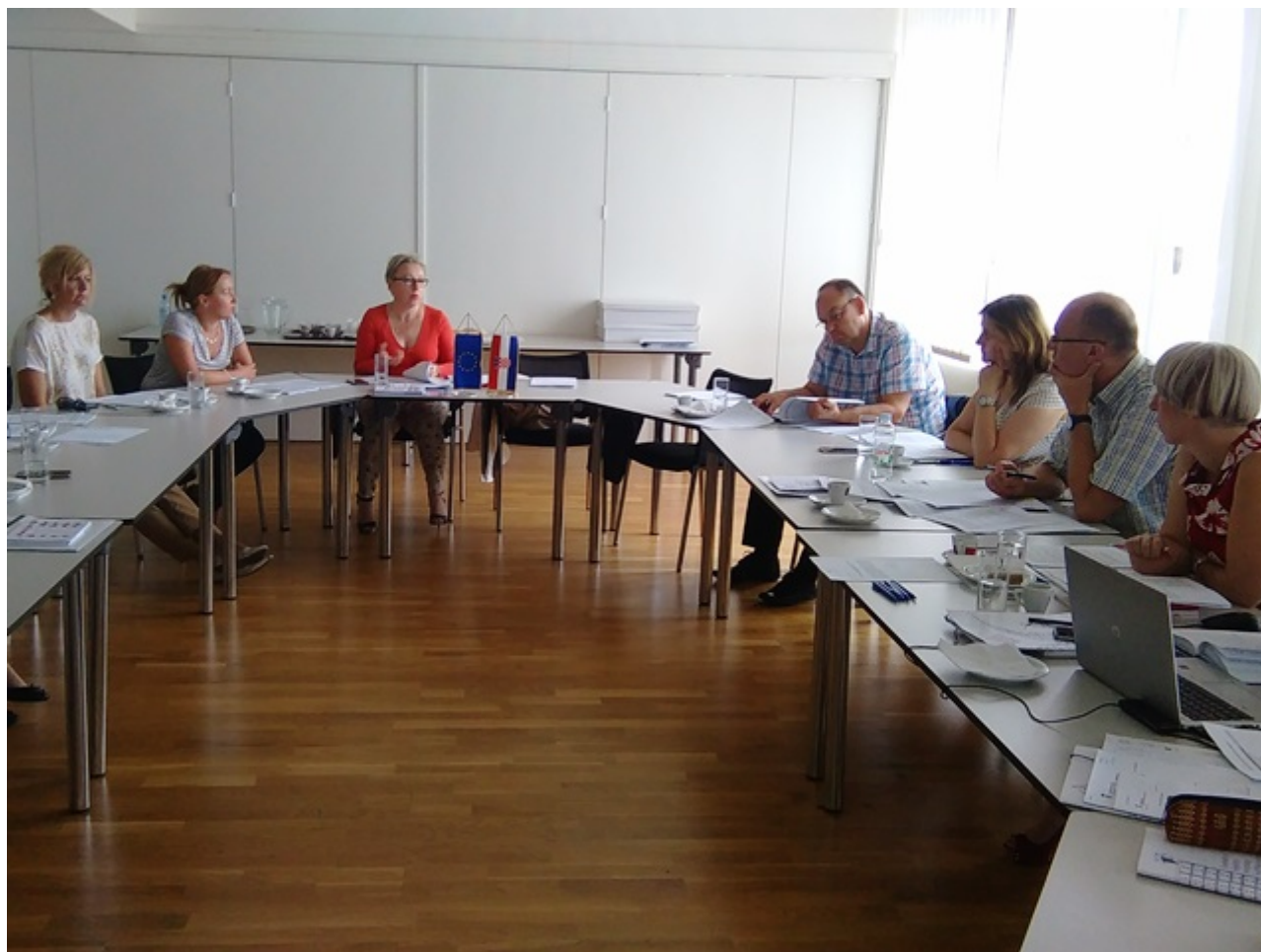
4 th session of Sectoral Council IX – Economy and Trade

Since the request submission procedure is underway for the inclusion of more than 40 occupational standards and respective qualifications standards, they are also expected to be validated soon by the relevant sectoral councils and included in the CROQF Register.