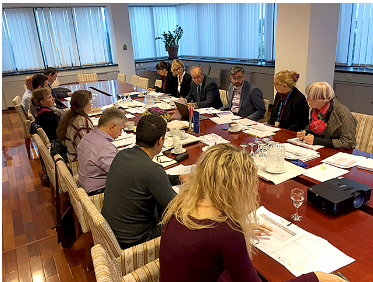
Inaugural session of Sectoral Council III. Mining, Geology and Chemical Technology

Furthermore, the inaugural sessions provided an opportunity to brief sectoral council members about the principles of work under the Sectoral Councils Rules of Procedure, and the Ministry of Labour and the Pension System also presented them with their first task: making recommendations for changes and improvements in the National Classification of Occupations.